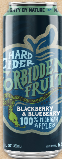
BLACK & BLUEBERRY